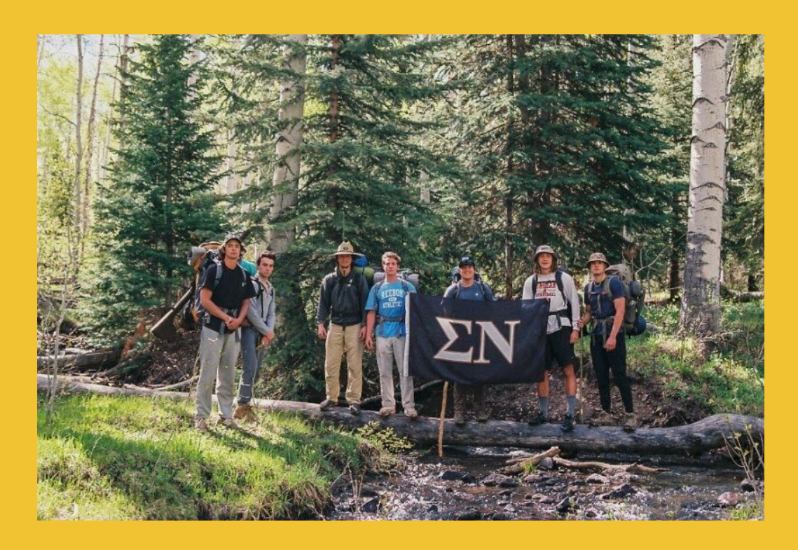
<u>Pictured:</u> Amidst the pandemic, these brothers wanted to escape Boulder and decided to go on a 4-Day backpacking trip in Flattops National Park this past fall.