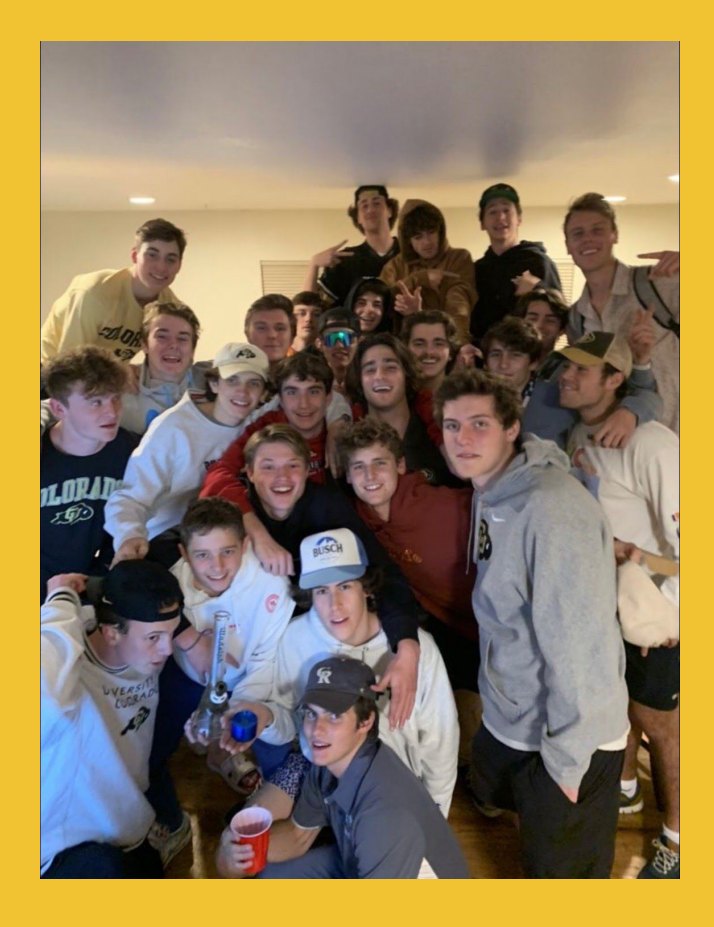
<u>Pictured</u>: The new Fall 2020 initiates celebrating becoming brothers of Sigma Nu.